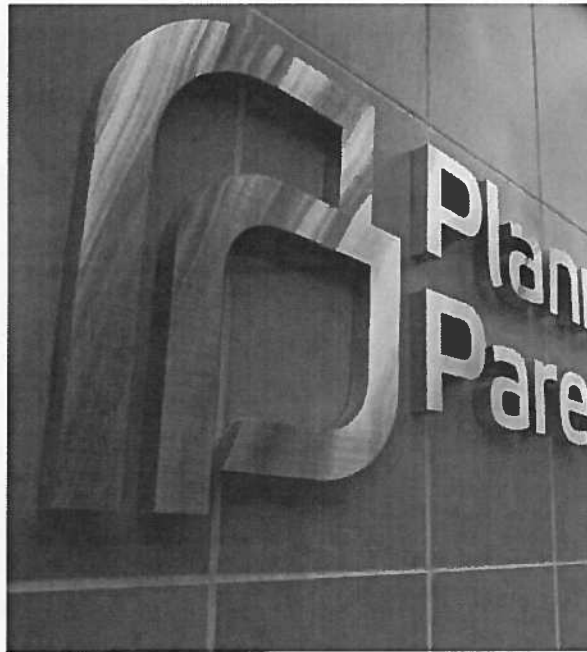
A sign is pictured at the entrance to a Planned Parenthood building in Houston. Picture taken August 31, 2015.

An aggressive legal strategy pursued by U.S. women's healthcare provider Planned Parenthood may have been critical in turning the tables on opponents who were seeking to prosecute it in Texas for allegedly profiting from sales of aborted fetal tissue.