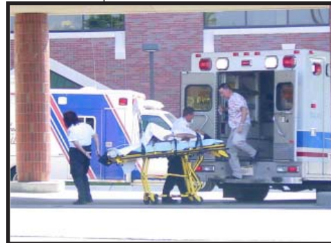
Tiller rushes another victim of a botched abortion to the emergency room.