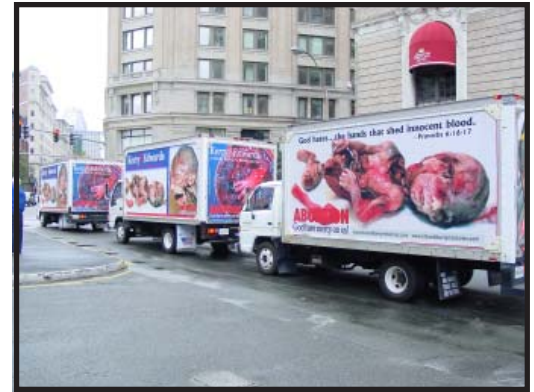
Truth Trucks in "convoy" make the impact even more effective!