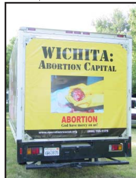
Please continue to pray for the bold and effective work happening in Wichita.