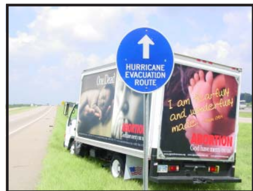
Only Hurricane Ivan stalled the Truth Truck, but the evacuation route was a perfect place to set up.

These are only some of the special events and do not include the regular tours through out Florida and the Mid-West. Operation Rescue has borne witness of the truth to millions of Americans in the last few months.