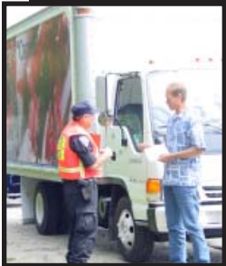
The Truth Trucks have been harrassed many times by police