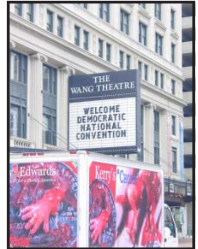
Truth is unavoidable.

After the convention, one Truth Truck followed Kerry’s campaign bus tour through, Iowa, Illinois, Missouri and Kansas.